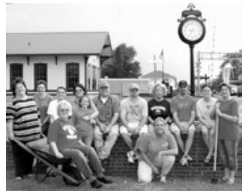
LMC Class I gave back to their county by raising money to landscape the flower beds in front of the new Davis and Sulphur Chambers of Commerce Buildings.

Graduation of Leadership Murray County Class I – Twenty-seven of 30 class members successfully graduated from Leadership Murray County Class I in May. Before graduation ceremonies