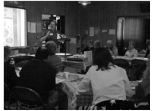
OSU Extension working with Alfalfa County

Other projects include being a host community for the Oklahoma Free Wheel, subcommittee meetings for mini-videos, networking with other agencies on area travel guide, completion of the kiosk panel, promotion of PRIDE program to area residents, distribution of Alfalfa County video, promotion of geocaching in Alfalfa County, radio frequency/loop, and signage.